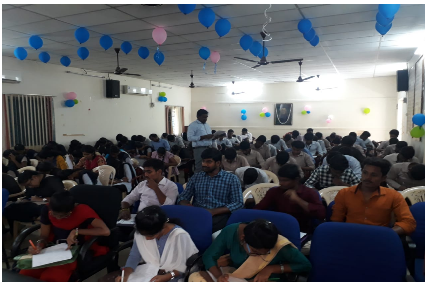
Written Test for the Students