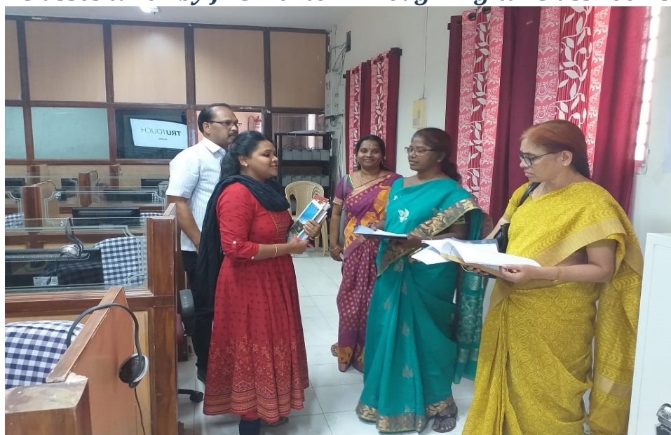
Academic Audit -2018-19 in JKC Lab with Academic Advisors