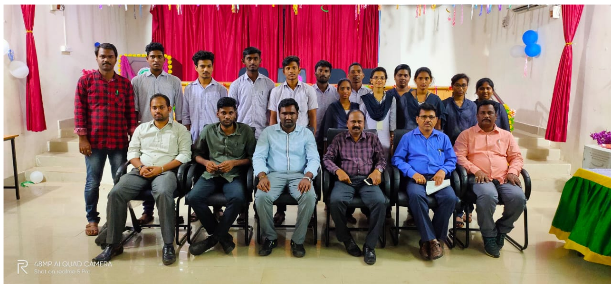
Selected Students With Principal ,Chemistry Department & JKC Mentor