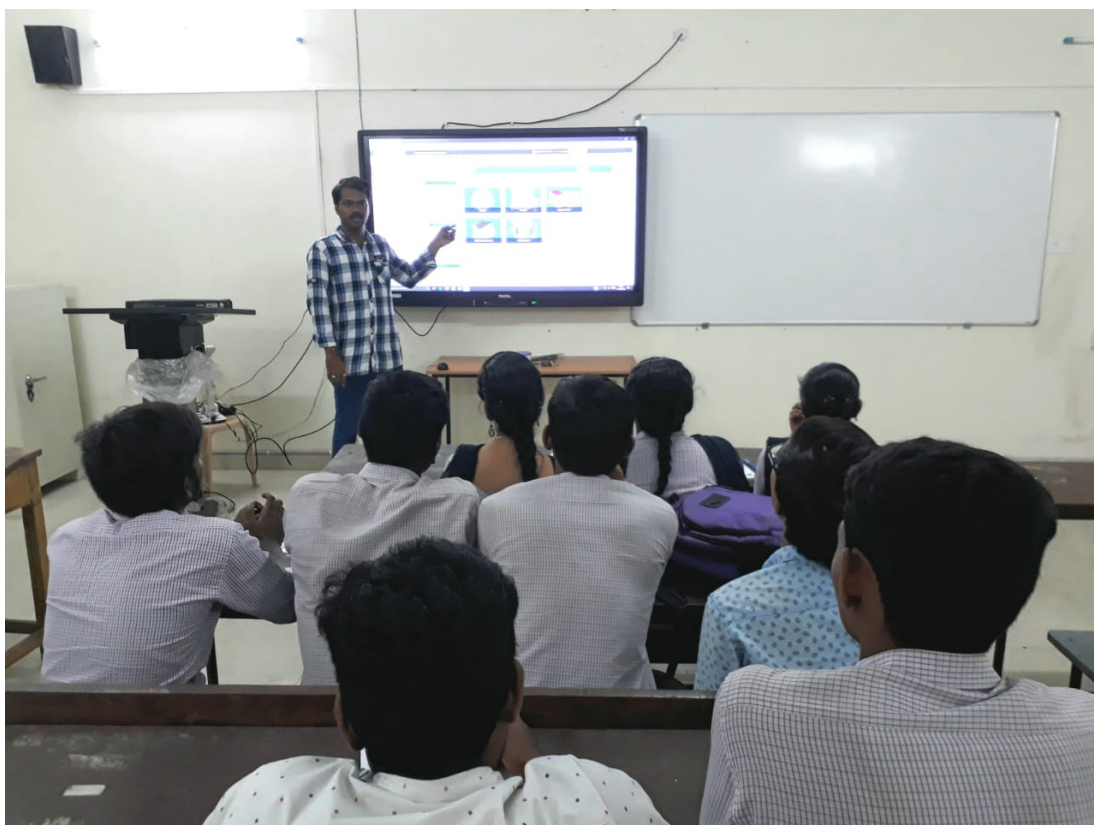
Classes taken by JKC Mentor Through Digital Class rooms